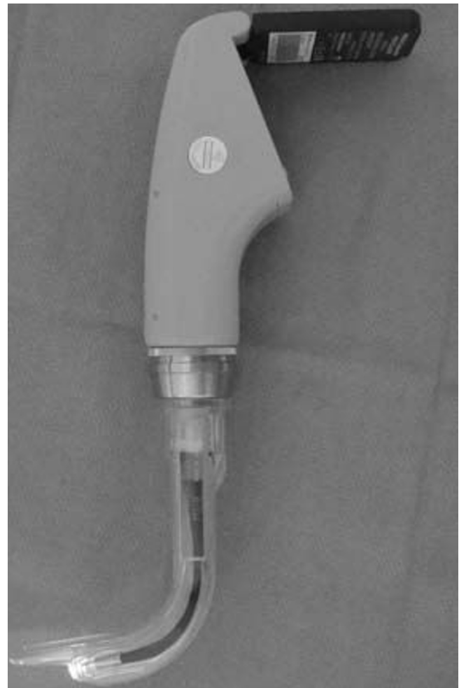
Figure 2 Photograph of the AWS® laryngoscope. The device is held in the left hand and passed into the mouth over the tongue, and the tip is placed under the epiglottis.

when used by APs is not known, and the relative efficacies of these devices in comparison to the Macintosh laryngoscope have not been compared in a single study.