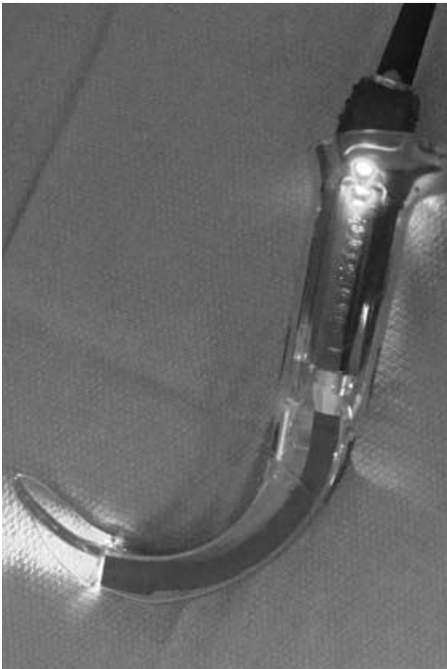
Figure 1 Photograph of the Glidescope laryngoscope. The device is held in the left hand and passed into the mouth over the tongue, and the tip placed in the vallecula or under the epiglottis.

The recent development of a number of indirect laryngoscopes, which do not require alignment of the oral-pharyngeal-tracheal axes, may reduce the difficulty of tracheal intubation in the prehospital setting. Two portable indirect laryngoscopes, which could be included in ambulance equipment inventories, are the Glidescope® (Saturn Biomedical System Inc., Burnaby, Canada) (Figure 1) and the AWS® (Hoya Corporation, Tokyo, Japan) (Figure 2) laryngoscopes. Clinical studies have demonstrated advantages over the Macintosh laryngoscope for both the Glidescope® [6-9], and the AWS® [8,10] laryngoscopes. However, the efficacy of the Glidescope® and the AWS®