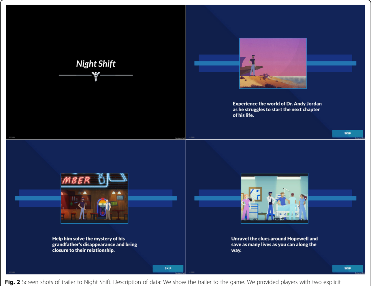
objectives in order to heighten narrative engagement, while simultaneously providing a vehicle for physician education

The mystery component of Night Shift occurs concurrently with the clinical challenges, and serves to facilitate