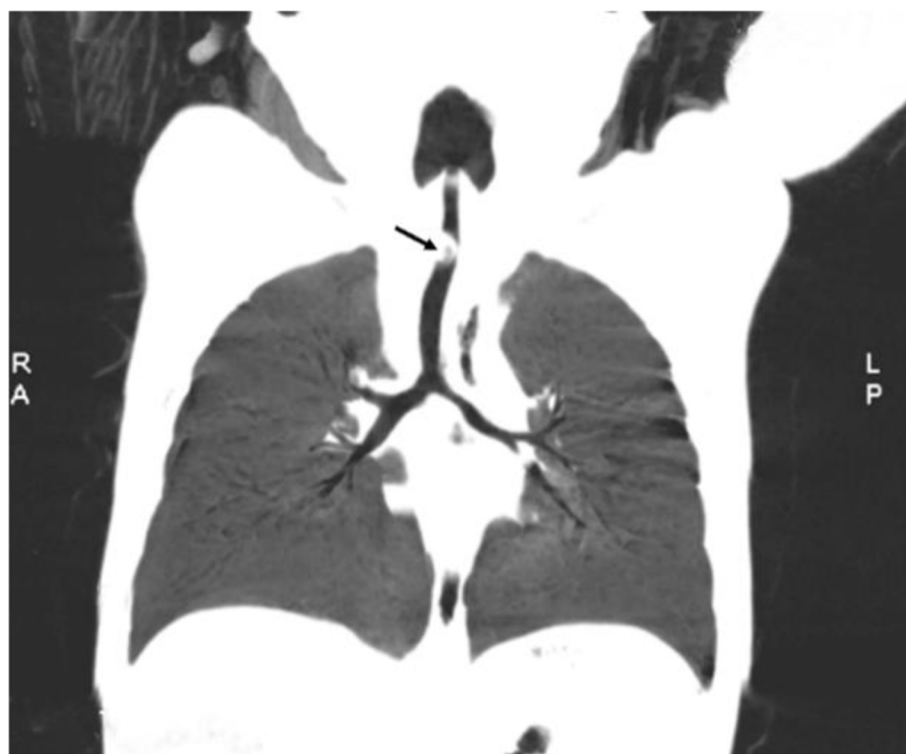
Fig. 3 Multislice spiral CT showed an endotracheal foreign body (peanut)

and chest was performed. However, when waiting for the examination, the child developed vomiting and lethargy and failed to improve prior to CT examination. Physical examination showed depressed mental status, pale face, a shallow and frequent breathing pattern, no obvious three concave sign, weak breath sounds on both sides, a few wheezes, and blood oxygen saturation of 75%. The possibility of foreign bodies in bilateral bronchi was considered, and a first-aid fast track was urgently established. Laryngoscopy was used to expose the glottis under anaesthesia, and gastric juice, mucus, and several pieces of broken peanut were found in the throat. After the placement of the rigid bronchoscope, it was discovered that gastric mucus was found in the trachea, and several pieces of peanuts were obstructing the bronchi bilaterally. The operation was successful. After the operation, the patient was transferred to the PICU with tracheal intubation for monitoring. The patient recovered normally and was discharged from the hospital.