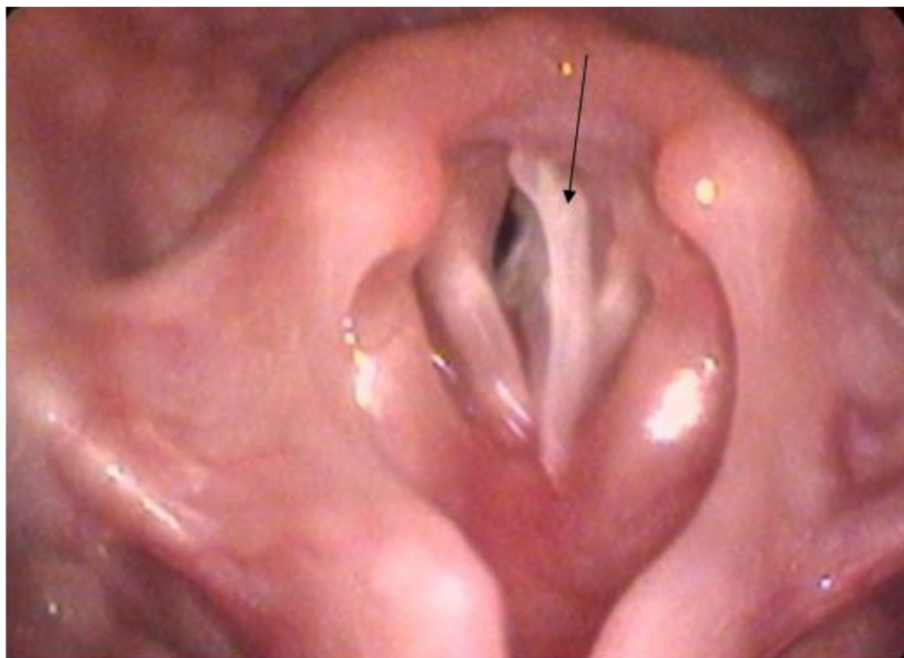
Fig. 1 Electronic laryngoscope examination showed a foreign body in the glottis (fishbone)