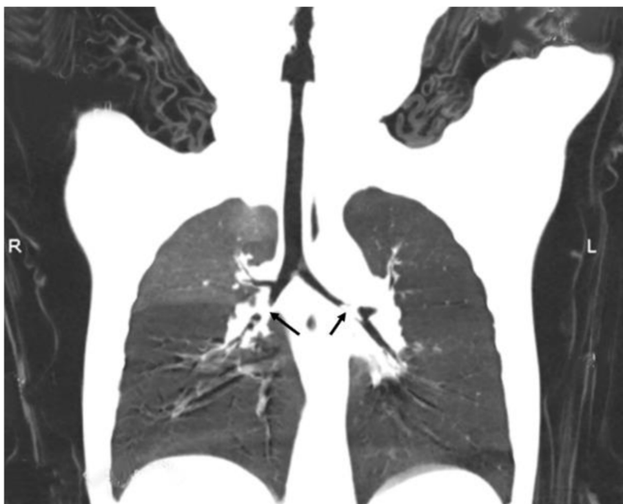
Fig. 2 Multislice spiral CT showed a bilateral bronchial foreign body (peanut)