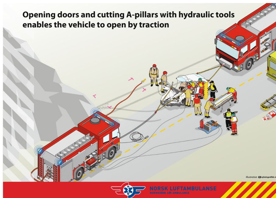
Figure 2 Rapid extrication technique.

Written consent was gathered. The Regional Committee for Medical and Health Research Ethics concluded that the project did not fall under the committee’s mandate (2012/990 A). The Norwegian Social Science Data Service found that the study complied with the requirements of the Personal Data Act (project number 31025). Data were coded and analysed in Excel (Microsoft Corporation, USA) and STATA/SE 11.1 (Statacorp, USA). STROBE (STrengthening the Reporting of OBservational studies in Epidemiology) guidelines for observational research and the