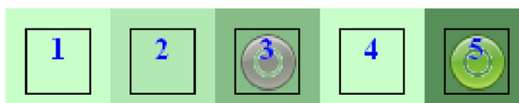
Figure 1 An example from the website of a color histogram of previous responses.

As the focus of this study was to understand which items should be included in a mass casualties response, it was important to understand which items gained consensus as being 'important' or 'very important', and conversely, which items were viewed as being 'unimportant', or 'very unimportant'. An item was deemed to be 'important' or 'very important' if it had been rated as either four or five by at least 80% of respondents. Similarly, an item was deemed to be 'unimportant' or 'very unimportant' if it had been rated as either two or one by at least 80% of respondents.