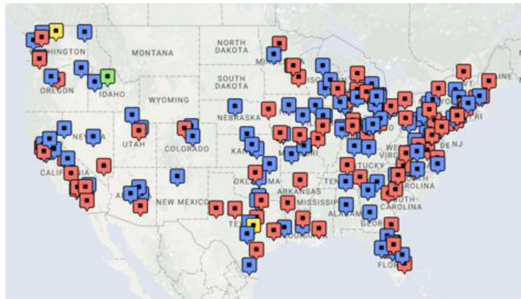
Fig. 1 Map of Providers by Practice Type and Location. Map of the continental United States with flags denoting the practice location and type of practice (academic, community, urgent care, or other) KEY: Red – Academic Practice, Blue – Community Practice, Green – Urgent Care Practice, Yellow – Other *Note: 2 responses from Alaska and 2 responses from Hawaii. An additional 29 responses were international (14 from Canada)

primary cause as shown in Table 2. Of those patients, the majority are female (38% male, 95%CI 36–39). For patients whom they believe anxiety or panic is the primary problem, respondents indicated that they directly communicate this belief to only 42% of these patients, and offer anxiolytic treatment to only 41% in the ED. Additionally, they offer discharge instructions and prescriptions for anxiolytics in 48 and 21%, respectively. Though 54% of respondents indicated they believe they have a professional responsibility to provide patients with an actual ICD-code diagnosis of anxiety when life threats are ruled out, providers report documenting a specific ICD-code diagnosis of “anxiety” or “panic” only 29% of the time (95%CI 27–32). Providers appeared