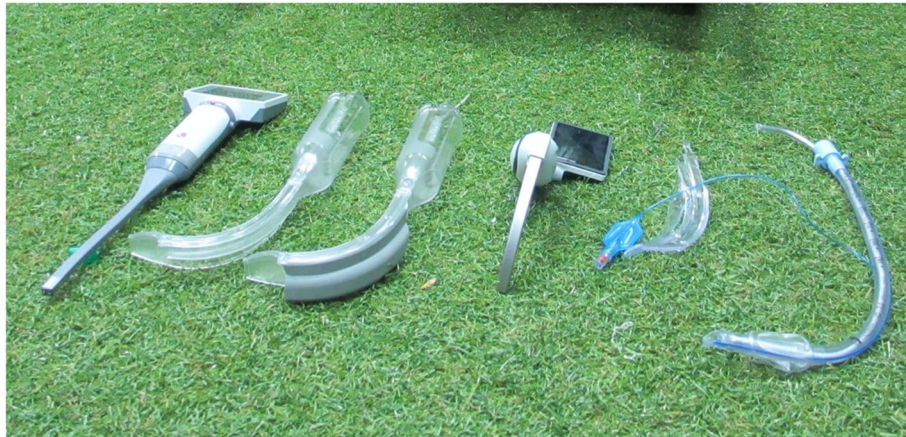
Fig. 1 (From Left to Right) KingVision Video Laryngoscope with Non-Channeled and Channeled Blades, McGrath Video Laryngoscope, Endotracheal Tube with Stylet in-situ.