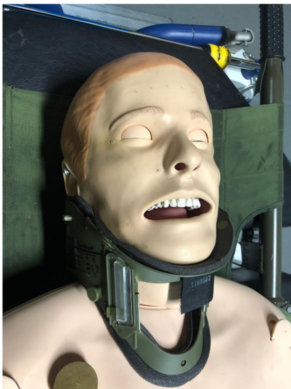
Fig. 2 Manikin with simulated difficult airway (Tongue-swelling, cervical collar in-situ, and placed on a stretcher). (Photograph by Chin BZB, permission granted to use)

Each participant was given 1 attempt for direct laryngoscopy of the SimMan® 3G manikin placed on a stretcher on the ground for which the time to intubation (TTI) was recorded. TTI was defined as time from when the participant picks up the laryngoscope to when